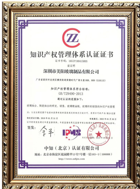
Harta intelek perusahaan