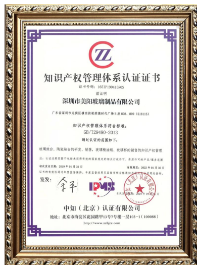
Harta intelek perusahaan