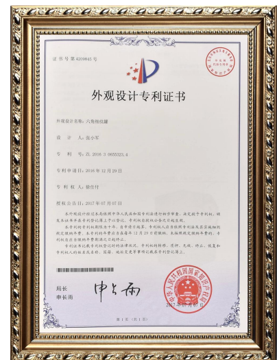
Nombor Paten: 201630655323.4