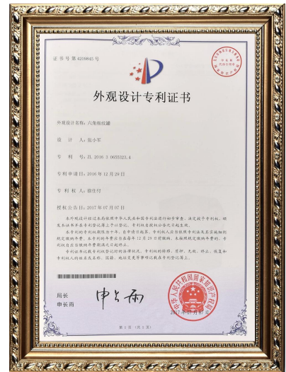
Paten No.: 201630655323.4