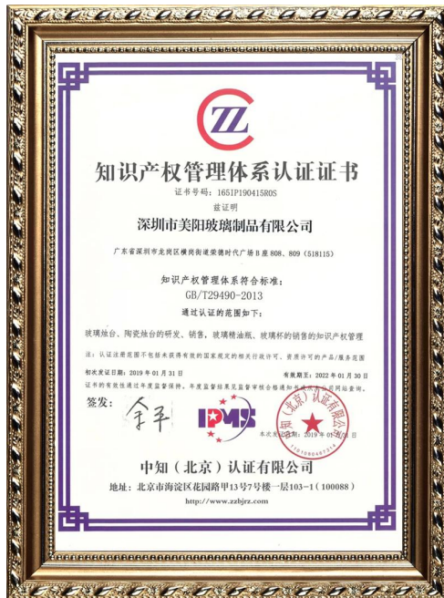
Harta intelek perusahaan