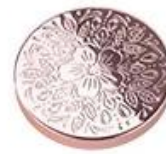
Zinc alloy embossed