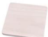
White pine wood lid