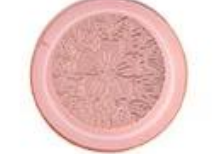
Zinc alloy embossed