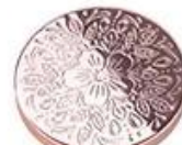
Zinc alloy embossed