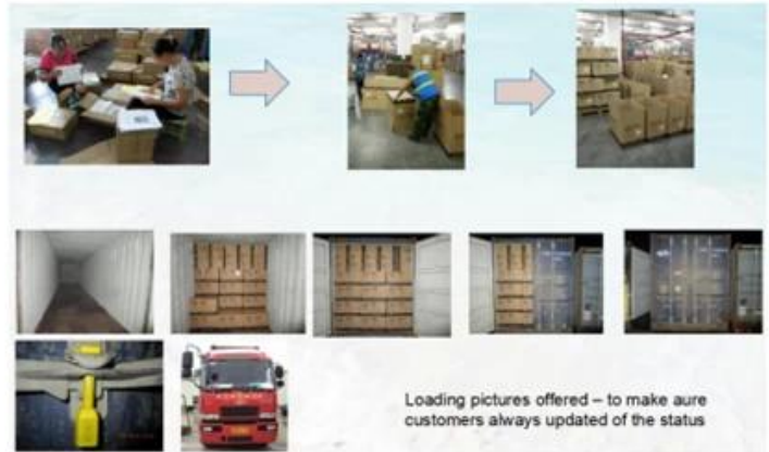
Packing & Loading

Loading pictures offered – to make sure customers always updated of the status