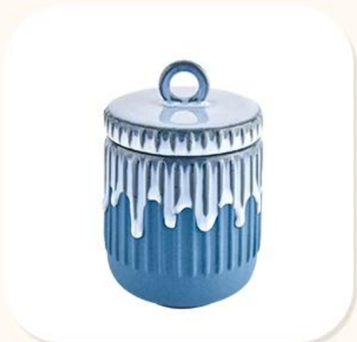
Ceramic Candle jar