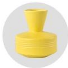
Solid color glaze