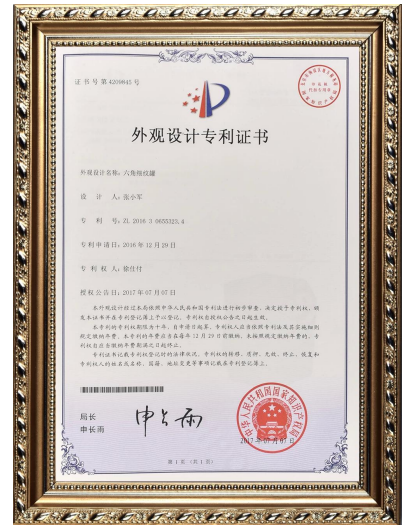
Numero di brevetto: 201630655323.4