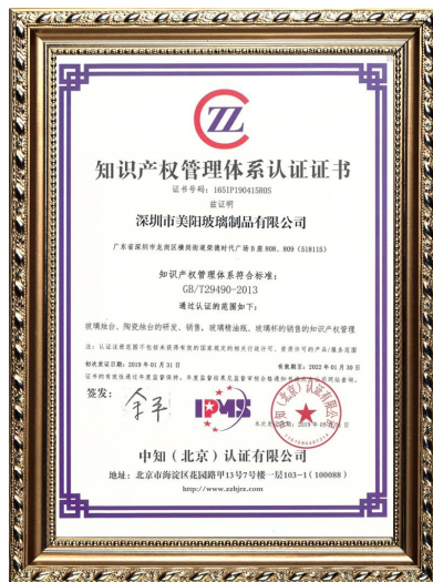
Proprietà intellettuale dell'azienda