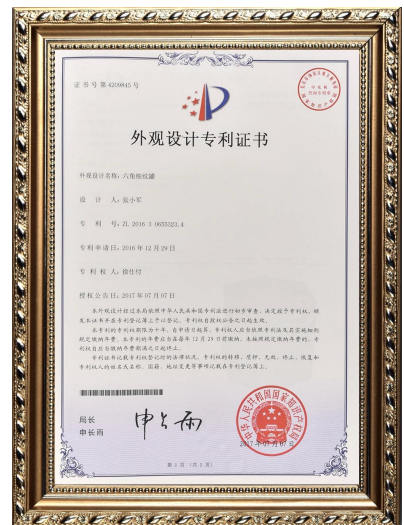
Numero di brevetto: 201630655323.4