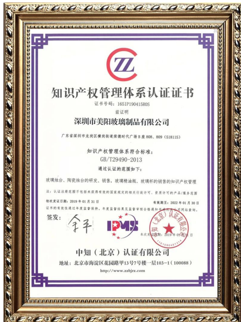
Propriété intellectuelle de l'entreprise