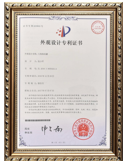
N° de brevet : 201630655323.4