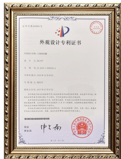
Numéro de brevet : 201630655323.4