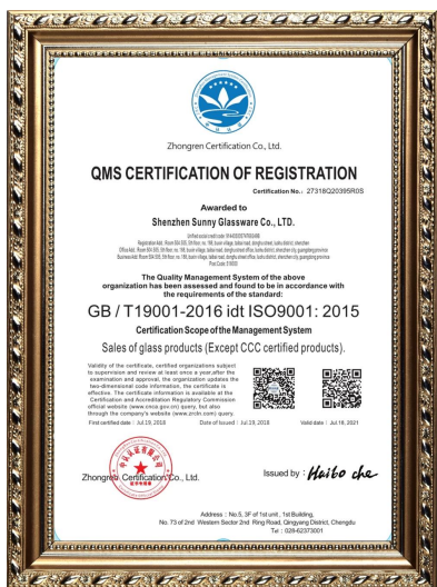
ISO 9001 : 2015