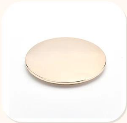
Zinc Alloy Cover