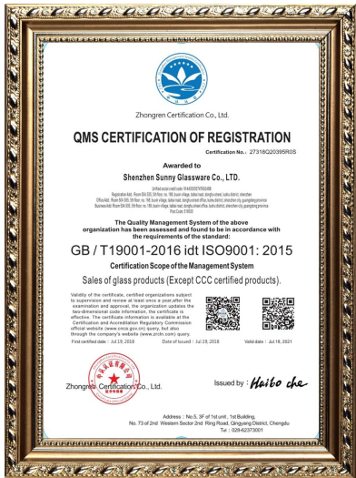
Norma ISO 9001:2015