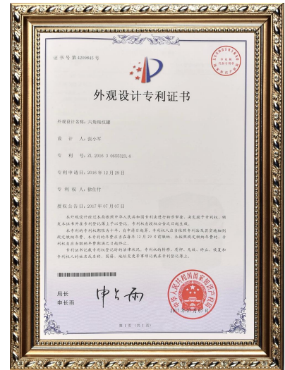
N.º de patente: 201630655323.4