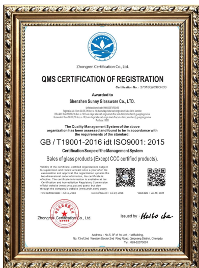
Norma ISO 9001:2015