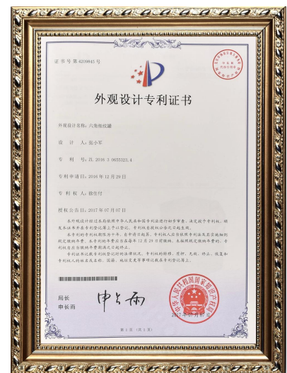
Número de patente: 201630655323.4