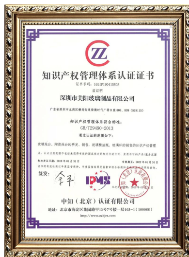
propiedad intelectual empresarial