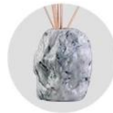
Water Transfer Printing