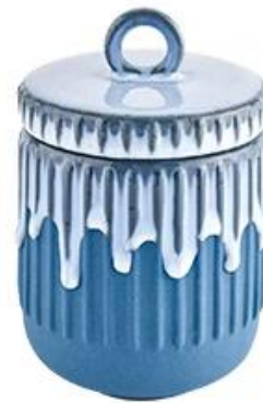
Ceramic Candle jar