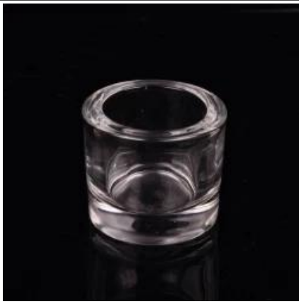
Cylinder tealight candle holder