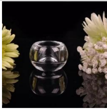
Round small tealight holder