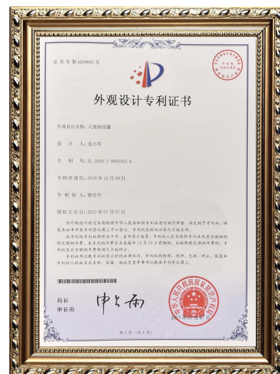
Número de patente: 201630655323.4