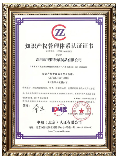
propiedad intelectual empresarial