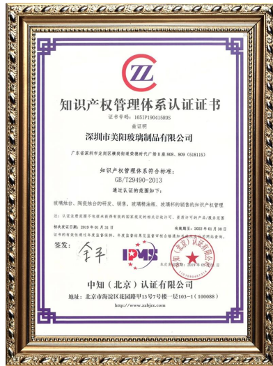
Geistiges Eigentum von Unternehmen