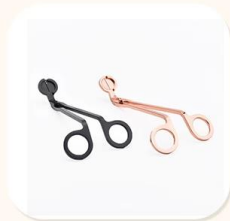
Wick Trimmer Cutter

. Dekoratives Abendessen in der Bar oder Bar