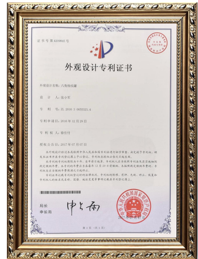
Patent Nr.: 201630655323.4