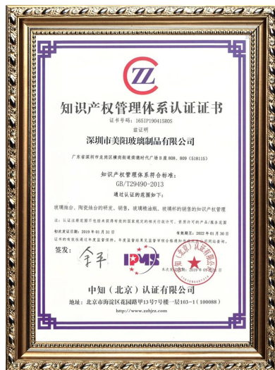
Geistiges Eigentum von Unternehmen