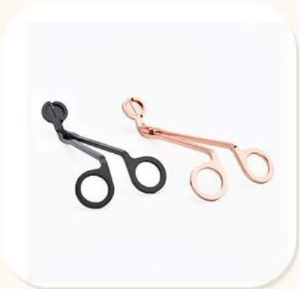
Wick Trimmer Cutter