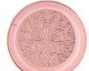
Zinc alloy embossed