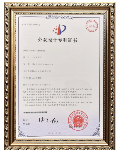
رقم براءة الاختراع: 201630655323.4