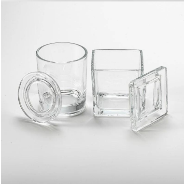
طلب: عشاء مزخرف في البار أو الفار - ماسك للفاتات أو الفانق أو الحداق - هبة عائش حاصه - أي فرصة للبرنة