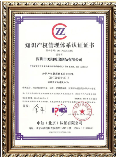
الملكية الفكرية للشركات