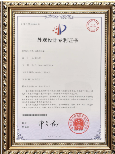
رقم براءة الاختراع: 201630655323.4