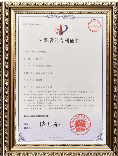
رقم براءة الاختراع: 201630655323.4