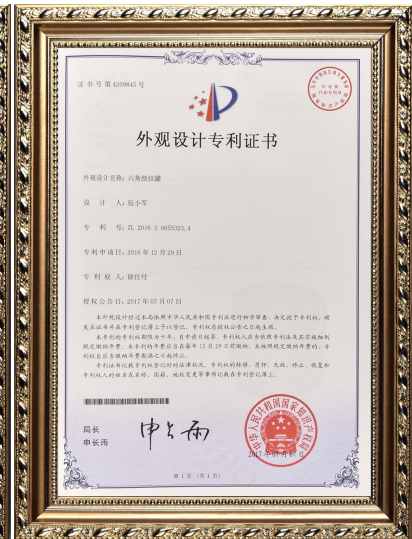
رقم براءة الاختراع: 201630655323.4