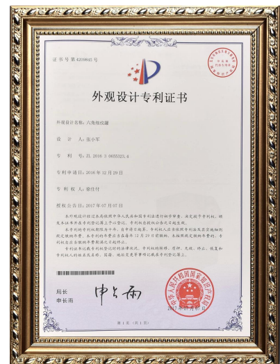
رقم براءة الاختراع: 201630655323.4