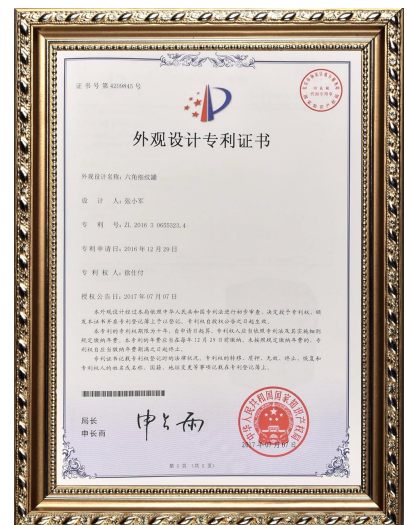
رقم براءة الاختراع: 20163065323.4